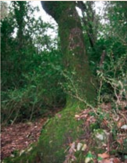
Through the shady woodland