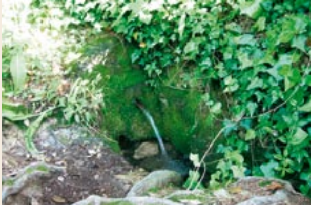
Font de l'Escopeta