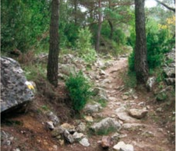
PR footpath markers

created using the same dry stone as used in boundary walls and also those constructed to support the terraces, and particularly the most transited or steeper sections. It's also not uncommon to come across places where the rock has been broken up to make way for the path. (Rafael López-Mon-