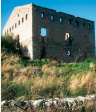
Molí del Pont de Goi

the south side there is a plaque showing the water levels reached during various floods.