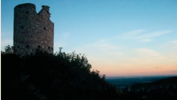
La Torre del Petrol

turn back on itself and form the Estret de la Riba. In front, just a stones throw away, is the village. We pass some curious boundaries and turn south towards the Serrat del Querol in search of the pass. Now, beneath us we have the south end of the La Riba rail tunnel and high speed train line. We begin to descend sharply, carefully following the marker stones which guide our way.