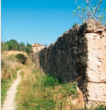
La Granja de Doldellops