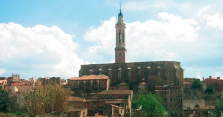
Valls. Església de Sant Joan