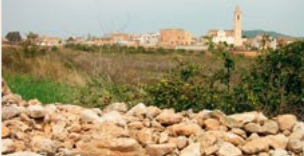
View of Rodonyà

Of the municipality, the Castell is well worth a mention. There remains nothing of the original castle but above this the existing Renaissance style castle was constructed, now a residència senyorial or stately home. The castle is of a square design and the walls topped with ramparts making this a very attractive building. The church, dedicated to Joan the Baptist is an 18th century neoclassic construction, square, with three naves and a transept and an octagonal tower.