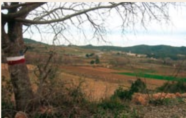
Marker indicating the GR 172-1, which we follow as far as Bràfim

Fork. Access to Mas d'Infants which we left below us, slightly hidden by the thick vegetation. On the right, another footpath also goes to the tower. Another hundred metres on and we pass another path going down to the cultivations. We make our way up a little until we come to the upper plain.