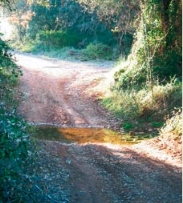
Torrent de les Pinetelles

there usually being water here, providing it hasn't been a particularly dry year. Once over the gully, we find a few metres of the track have been surfaced, with a view to preventing the track from eroding as it makes its way straight up.