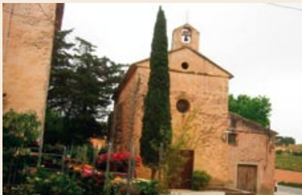
Església de Vilardida

We come to the start of the cultivations. The traces of what was once the old road is to our right, now no more than a ditch. We begin to come across the first cherry plantations. In front, we see the tower rising above Mas d'Infants and to our left, the Santuari de Montserrat and the village of Montferri, at the foot of the mountains of the same name, crowned by the Torre del Moro.